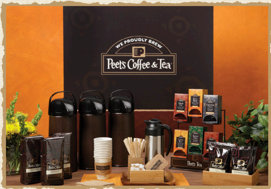
Peet's premium break station display