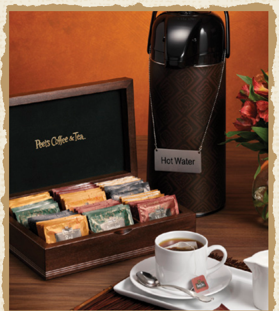
Peet's premium teas also available in the office