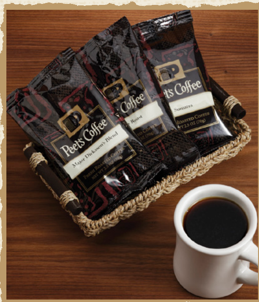
Peet's is available in portion packs and by the pound, in many single origin and blend offerings, whole bean and drip grind