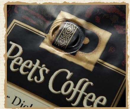
Peet's portion pack packaging with one-way gas-release valve for the ultimate freshness