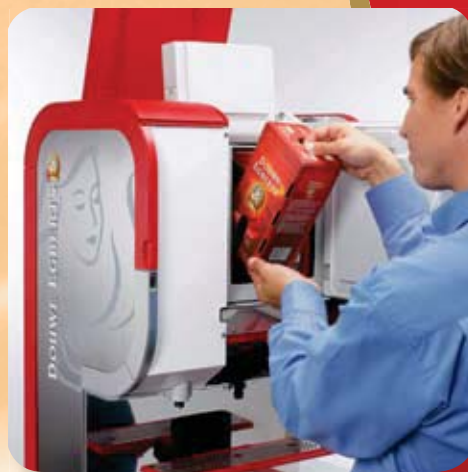
Product replacement is simple!