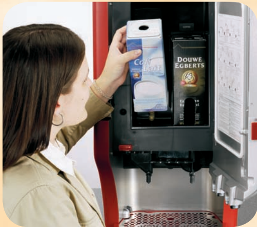
Product replacement is simple!