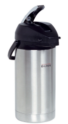
AIRPOT, 3.8L SST LA SINGLE PK