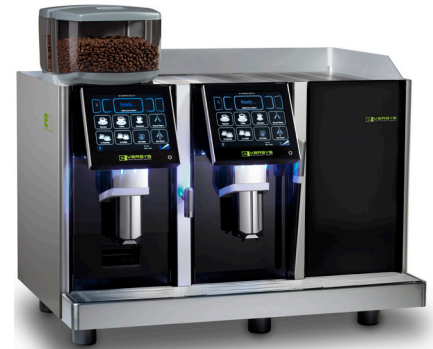
e4m / fridge