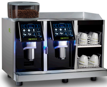
e4 / e4m / cup heater