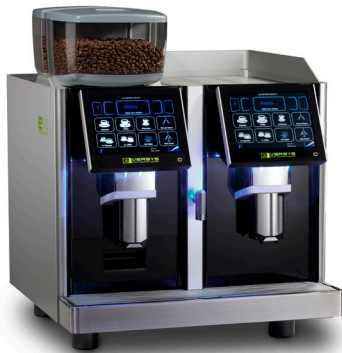
e4 / e4m