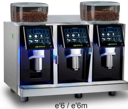
e'6 / e'6m